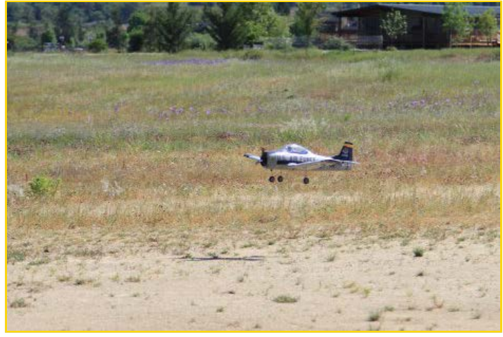
Texan looking for a good, smooth place to land.