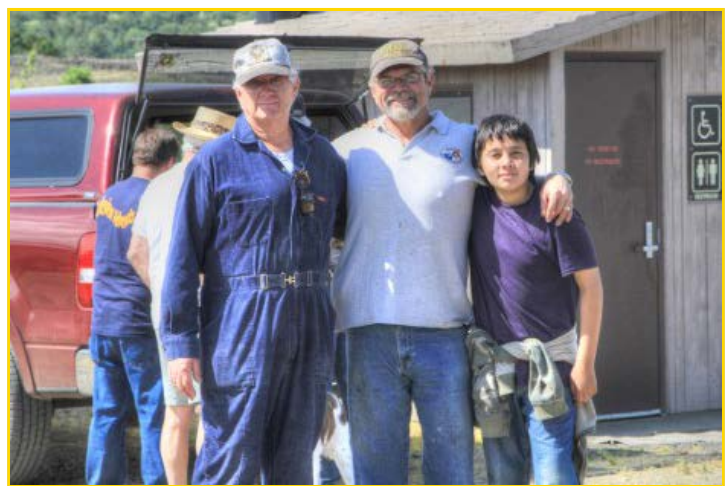
The early bird got the Corsair! The gentleman in the middle scored a giant scale Corsair for a pittance just