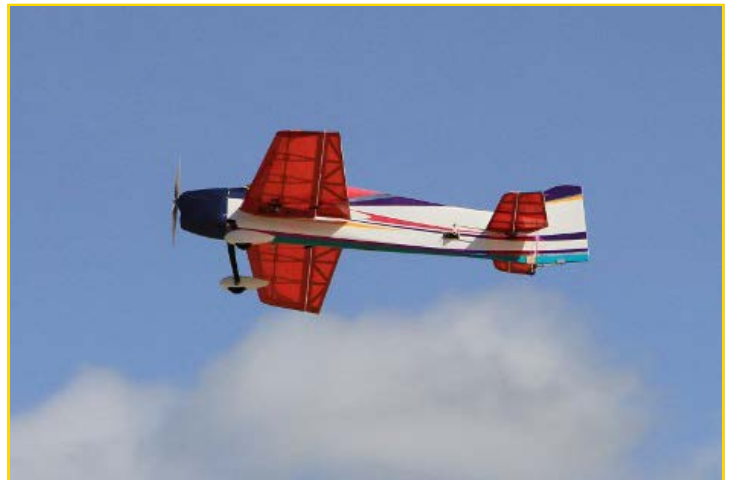
Their plane looks great in the air. It took off and landed with no drama whatsoever.