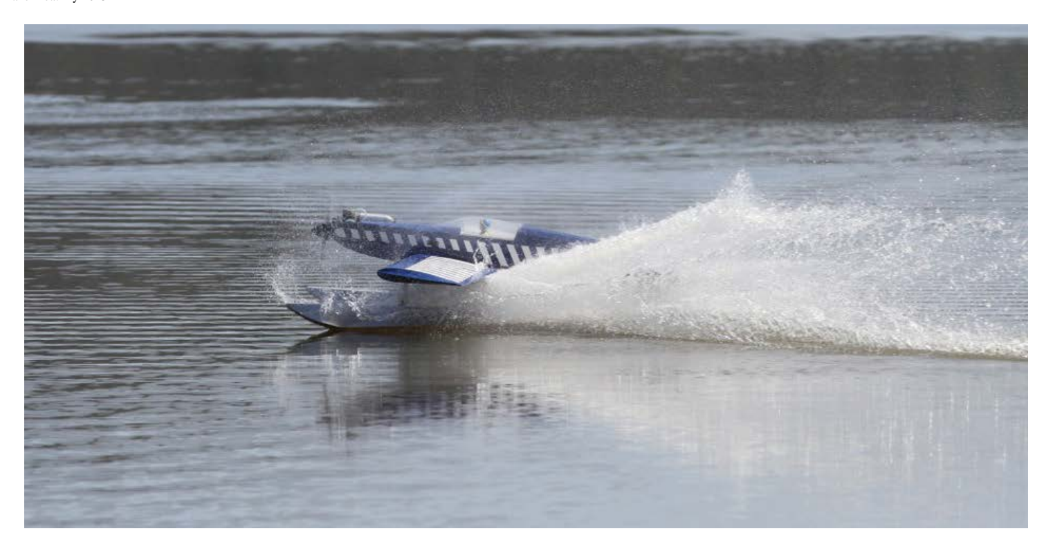
A nice Pulse.