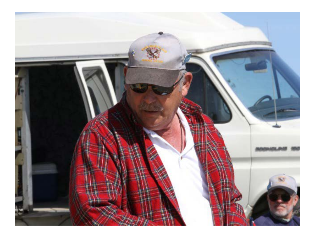
Updated: Thursday, April 25, 2013