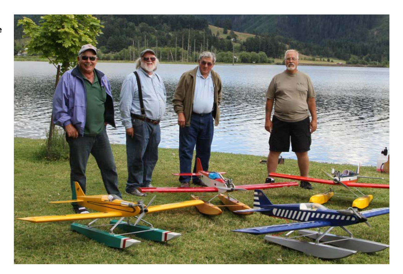
The boys with the Schneiders had a ball chasing each other all over the sky.

These are four very happy Venture pilots.