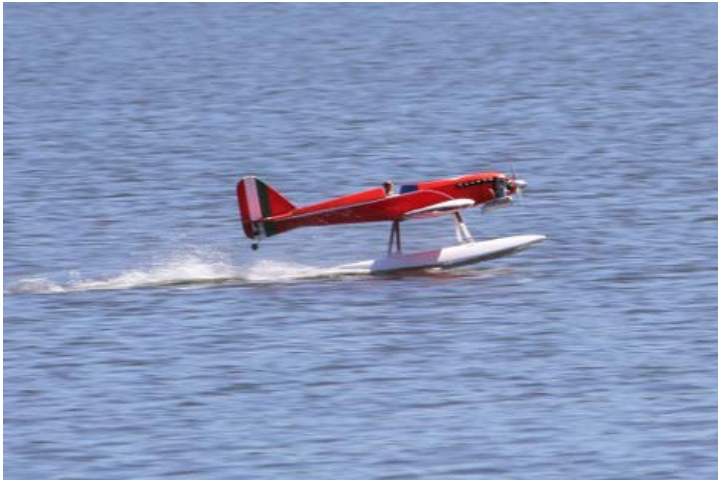
More eye candy