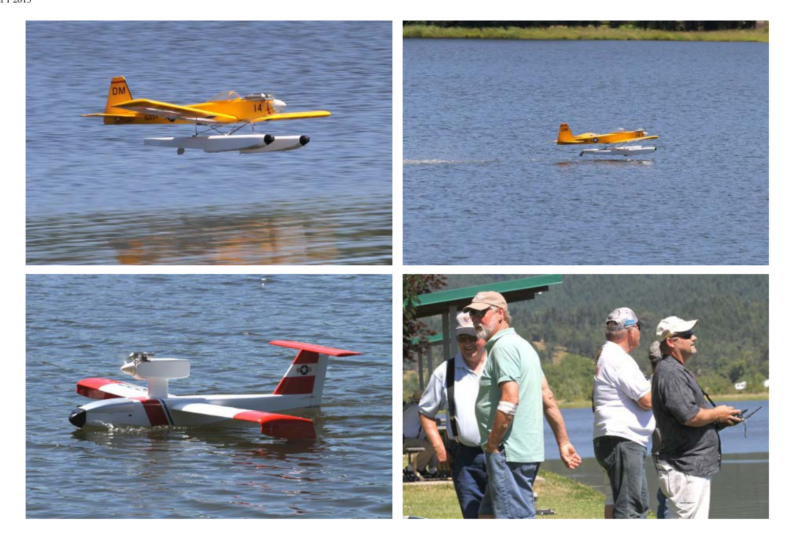
Updated: Monday, June 24, 2013