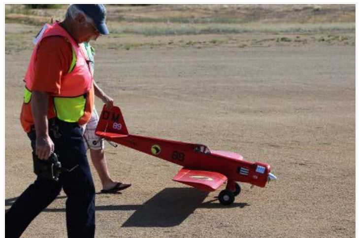
Mort Sullivan from Ashland, OR. with his customized 4 Star 120.