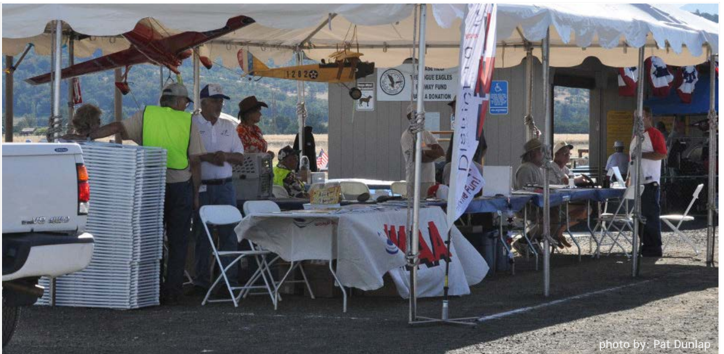
Spectator seats at Agate Field; Vendor's Row behind them.