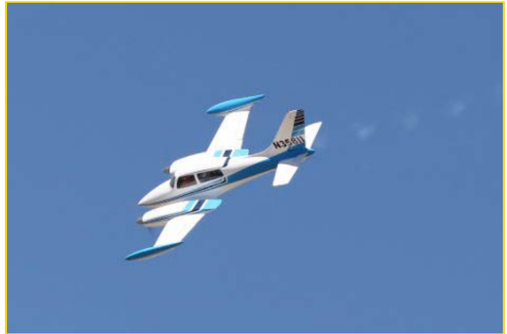
The easily recognized blue and white Cessna 310 belonging to ace pilot Bob Campbell visiting from Yoncalla, OR.