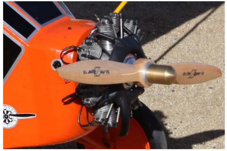
A close-up of the 7-cylinder Evolution radial on the nose of the Robin. Sweet music.