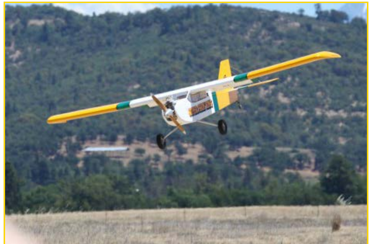
The Super Flyin' King weighs 36 pounds, spans 11 feet, and is powered by a 3W-75. Here it is coming in for a dead stick landing.