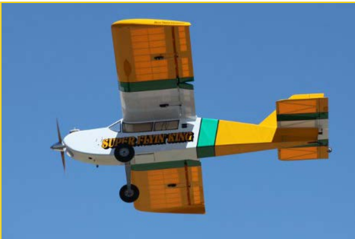
Bruce Tharpe's Super Flyin' King on a slow fly-by. Note flaps are deployed about halfway. This is the prototype for the kit that Bruce still manufactures. It's about 15-years old and still going strong.