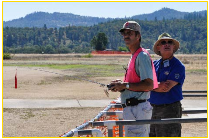
Flying safely with the aid of a trusted spotter.