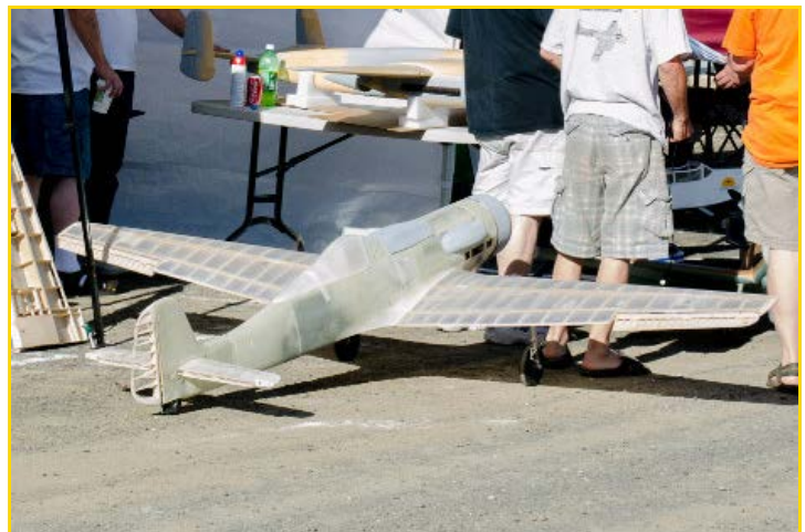
Under construction. Craftsman at work!