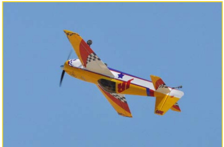
Chris Christopher from Hood River, OR., flying an Extra 260 powered by a DA 100.