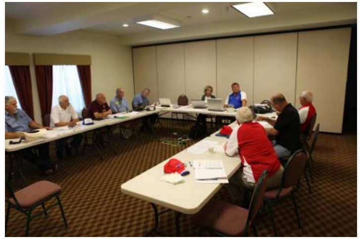
IMAA Board Meeting - 9 of the 12 Directors were present from all over the country.