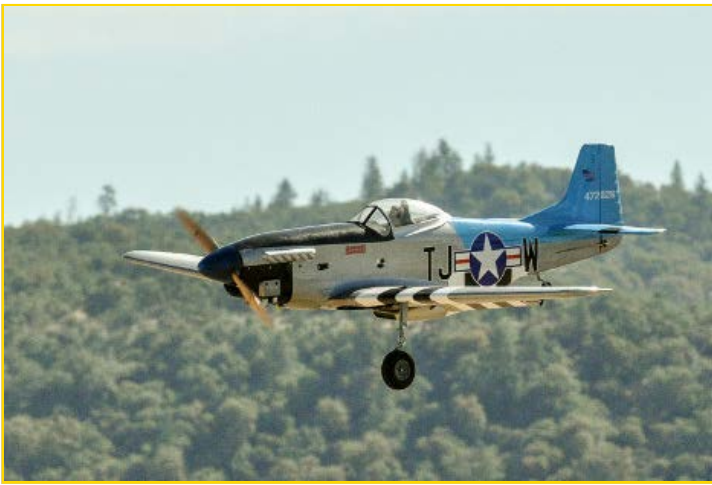
A P-51 Mustang on its final approach with only one wheel down.