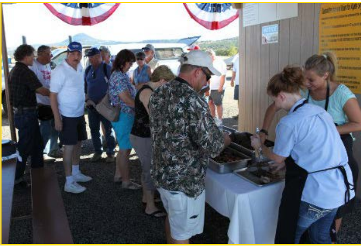
The Saturday evening banquet was catered by Yummie's Cowboy Cuisine. Excellent chow and nobody went away hungry!