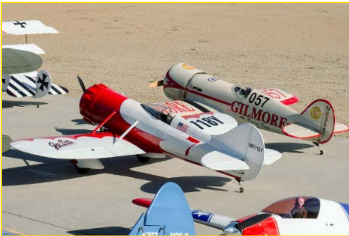
Two Golden Era racers... a model of the Granville Brothers Gee Bee Sportster, and a Gilmore Lion.