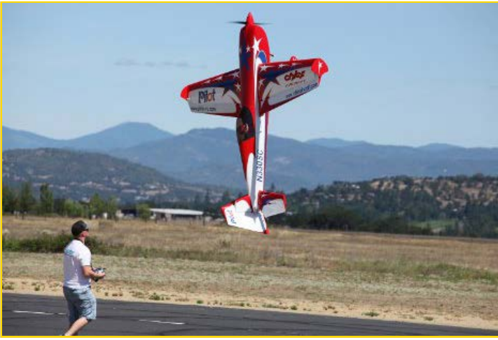
Chief Aircraft 3D Custom pilot Steve Coleman from Central Point, OR, flying a 40% Extra 300SC.