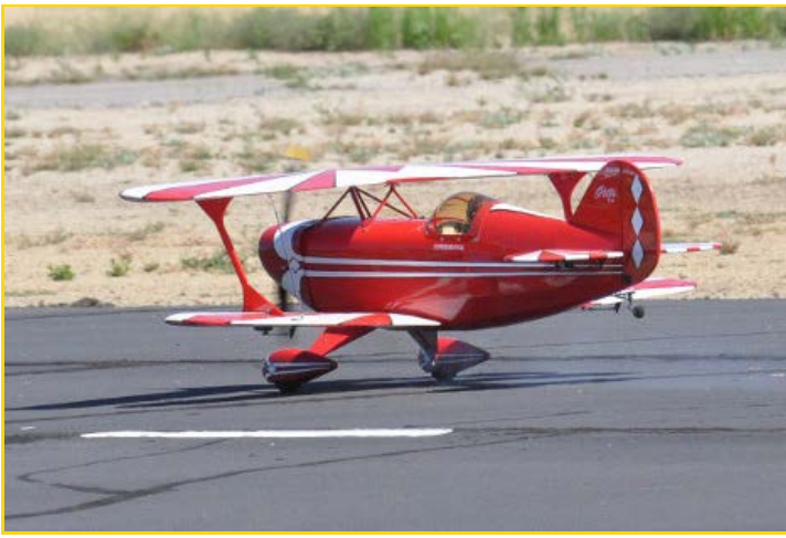
Alan Littlewood's nice Pitts Special.