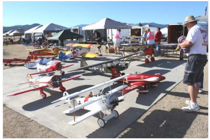
Birds on pad.