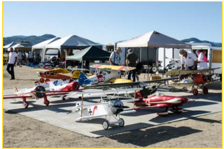
Airplanes spanning 75 years of flight share the pad.