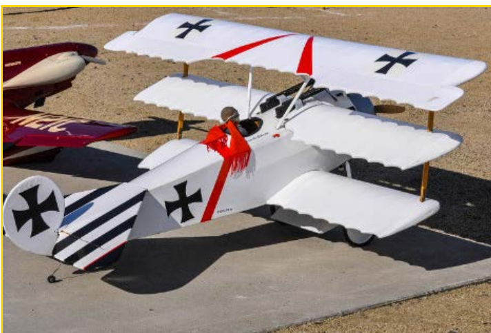
A beautiful Fokker DR-1 Triplane.