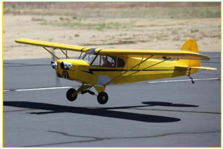
A 1/3 scale J3 Cub being piloted by Larry Maerz of Eagle Point, OR.