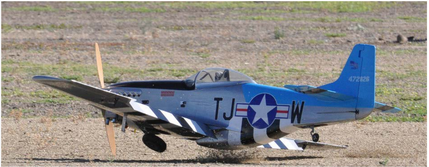
Great shot of failed retract landing.