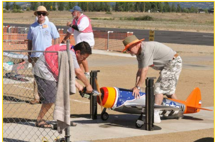
Safely starting up the Thunderbolt's engine.