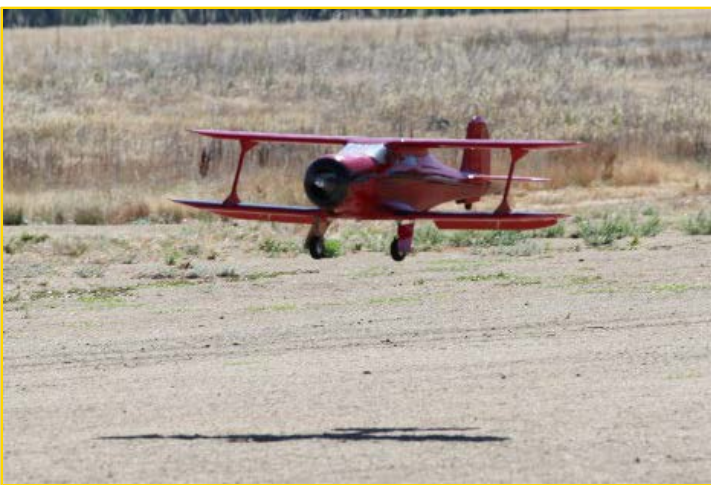
Great Planes Staggerwing Beech piloted by Mike West of Sunnyvale, CA.